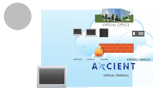
REMOTE MANAGEMENT CONSOLE

Other offsite virtualization services require users to engage their solution provider in order to initiate the virtualization process. While Axcient support is always available if needed, users can start and configure a virtual office without contacting Axcient. Simply follow the six easy steps outlined below.